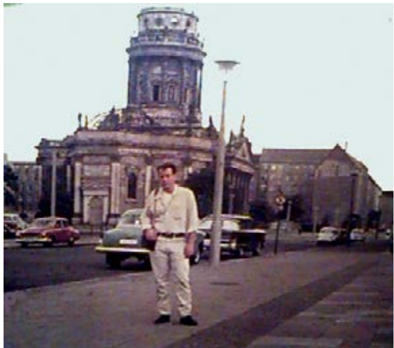
The author in 1964 outside the burned-out headquarters of the Third Reich in East Berlin.