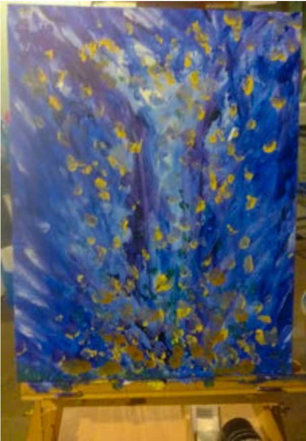
On the easel: one of he author's paintings.